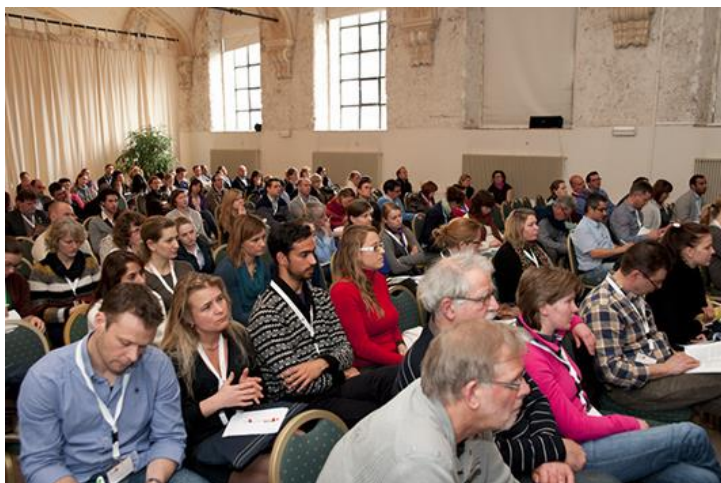
Picture: Audience 6 th EEHNC