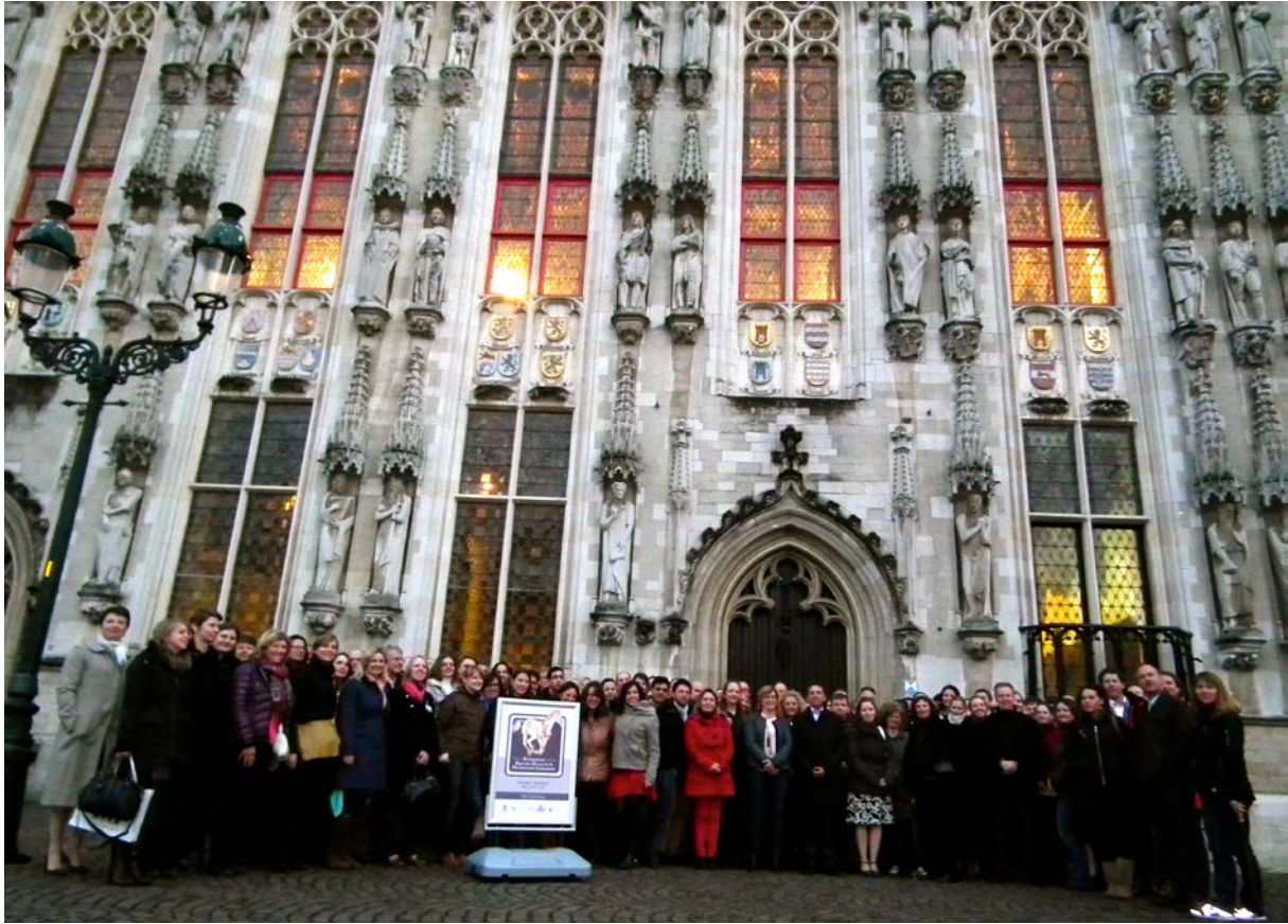
Over 130 congress delegates participated in the social programme of the EEHNC.

More pictures are available on request; Pictures can be used freely for 7 th EEHNC related articles but a copyright symbol followed by the photographer should be stated in/under the picture.