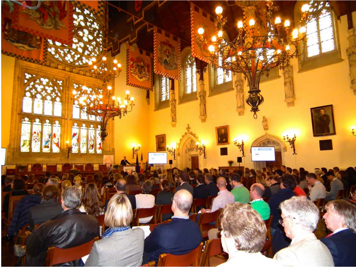
Over 220 delegates participated in the 7 th EEHNC that was held in the Provincial Palace in Bruges (Be).