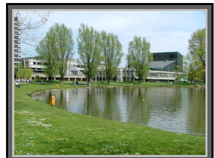
Fig. 3 Cultural centre "de schakel"