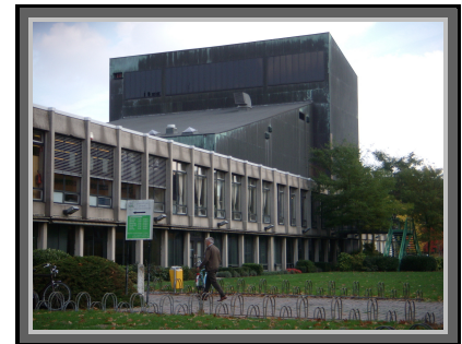
Fig. 2 Cultural centre "de schakel"