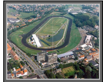
Fig. 1 Sportscentre the "Hippodroom".

Waregem has been noted in several scientific publications as being a centre concerned with the surrounding area which is populated by approximately 65 000 to 100 000 people. Culture, recreation and sports play an important role for the vicinity of Waregem. The cultural centre known as 'De Schakel' is a multifunctional building in which a library, a CD library, a fivehundred-seat theatre, an exhibition foyer and several other multifunctional rooms are located (Fig. 2, 3). It possesses one of the leading sports infrastructures too, not only in the entire district, but also in the province and in the country itself. As well as having an indoor swimming pool, it also features several sport centres (public and private), it