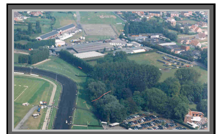
Fig. 4 Bloso centre