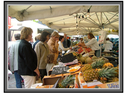
Fig. 5 Market square

Both Waregem and its dependent municipalities feature a number of scenic places, important buildings and an extended infrastructure worth visiting. These include, the town centre of Waregem, The Pand, the cultural centre 'De Schakel', the Baron Casier park, the Rainbow stadium (Regenboogstadion), the Gaverbeek hippodrome and Bloso centre, the American cemetery in 'Flanders Field', Goed te Nieuwenhove and many others.